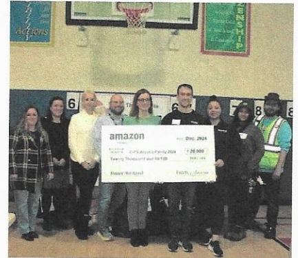
Amazon.Com $20,000 grant to Child and Family Services