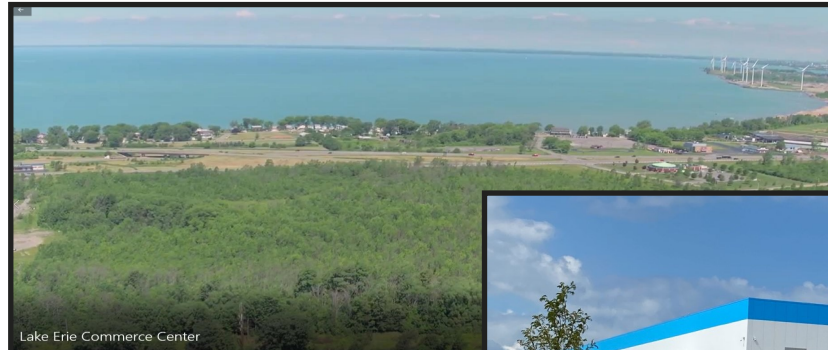
← BEFORE 68 ACRES UNDEVELOPED

Lake Erie Commerce Center Hamburg, New York 14219